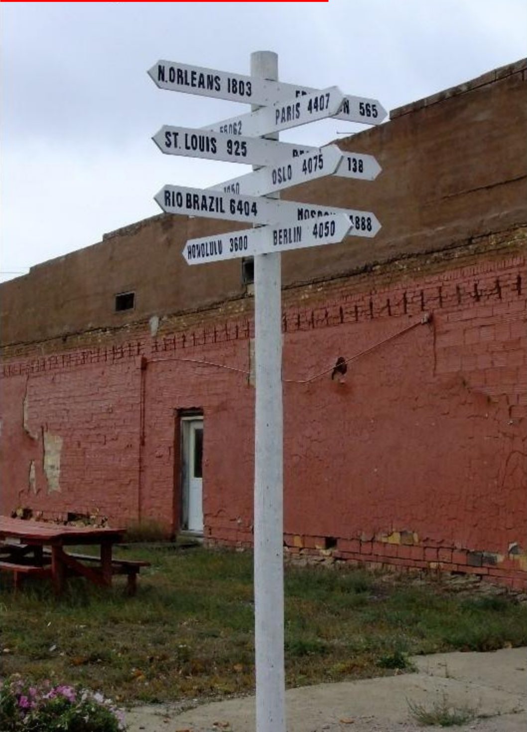
MARVIN HUNSTEAD DRUG STORE LOT MAIN STREET COLUMBUS